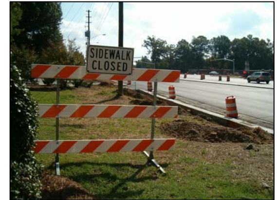
Figure 6-1. Current roadway construction projects in Cary will include new sidewalk.

http://townofcary.org/depts/budget/fy2007/budgetfy07summary.htm .