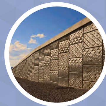
Transmountain Date: 2011, 2014 Placement: roadsides Collection: City of El Paso Museums & Cultural Affairs Department Artwork Type: architecture (object genre) Material: concrete, plant material