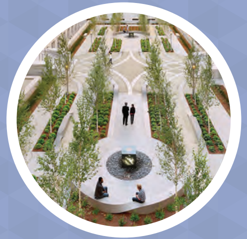
Cliff Garten Ribbons, 2012 50 UN Plaza, San Francisco, CA Cast Concrete, Granite