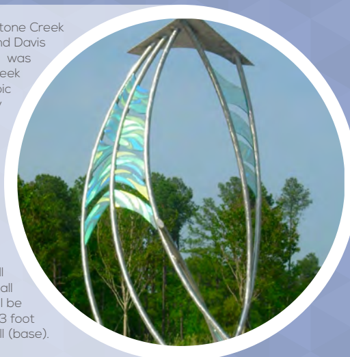
Windplow by Beverly Stucker-Precious Stone Creek Village, Cary, NC

The use of dichroic glass creates a burst of changing color as vehicles drive by and drivers are treated to an ever-changing display. The 3/4" thick fused glass panels are placed into slots in the stainless steel tubes and then sealed with industrial grade silicone. Windplow shall be designed and constructed with safety in mind. The dichroic glass shall be fused with plate glass to achieve a safe thickness. Windplow shall be attached to a 10 foot diameter concrete base and footing that is under 3 foot tall (base).