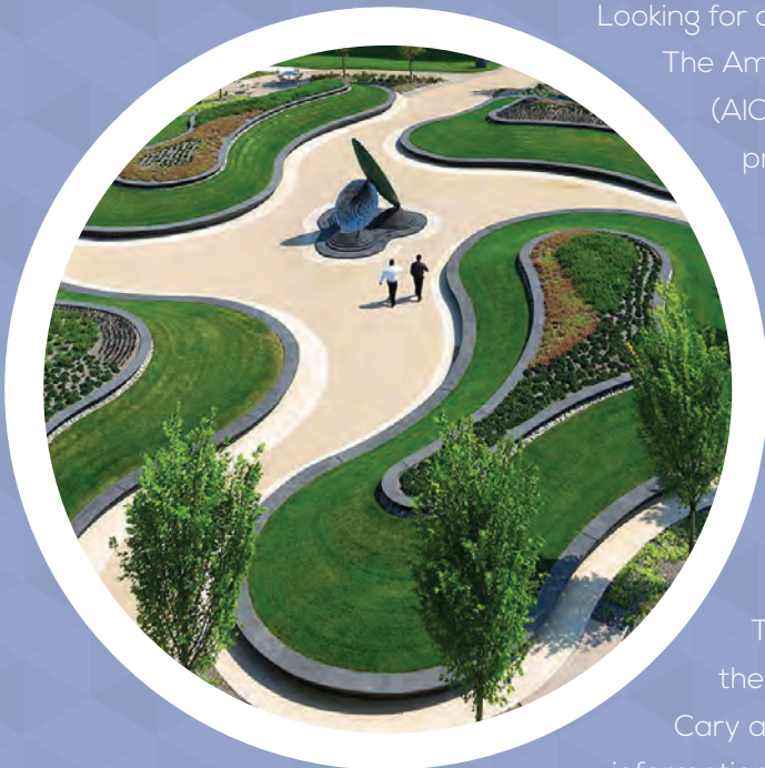
Cliff Garten Receptor, 2013 Patriot Ridge 16' tall by 20' diameter, Total Landscape Sculpture – 250'x400' Bronze, Stainless Steel, Concrete, Landscape and LED Lights Sculpture

Looking for a conservator to review a proposal or repair a work of art? The American Institute for Conservation of Historic and Artistic Works (AIC) is the national membership organization of conservation professionals. The website provides many resources regarding conservation and will assist you in finding a conservator for your project. For more information, visit www.conservation-us.org .