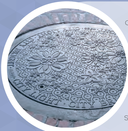
City Light, City Bright Seattle City Lights by Nancy Blum Seattle, Washington

Cast in bronze, thirty basins are positioned along 15 stops of the Charlotte Area Transit System. Sitting on a base by Haws Co. the dogwood basins integrate the platforms functional needs with a specific and unique design. Commissioned by Charlotte Area Transit System (CATS) Charlotte, NC Engineering and Pattern: Leonard Owen, Dallas TX Castings: Polich Tallix, Rock Tavern, NY