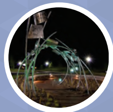
Time Passage by Jim Galluci Hospice of Wake County, Trinity Road