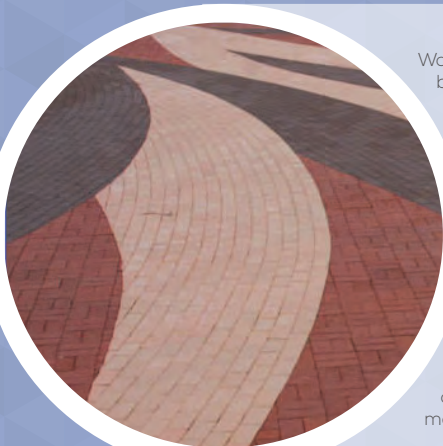
Walnut Street Park by Barbara Gryguttis Imaginary Garden, 2009 Artist: Barbara Gryguttis In collaboration with OBS Landscape Architects Material: native NC brick pavers Location: Walnut Street Park National Award Winner 2010 Brick Industry Association

These types of public art projects don't sit on pedestals: they are seamlessly integrated into the surrounding environment. When you bring an artist into a project early in the design process, the work of art can be built into construction documents, which can save time and money from a separate art installation. In many cases, the general contractor can perform some of the fabrication or installation, with the artist or fabrication specialist needed only for specific components.