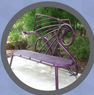
Benches at Kids Together Playground at Marla Dorrel Park Oracle Benches (2 benches), 2000 Artist: Jim Gallucci Materials: Painted Steel