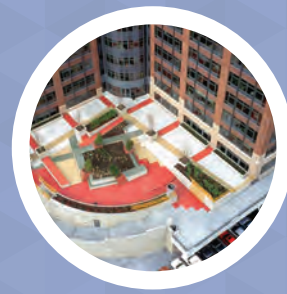
The Plaza