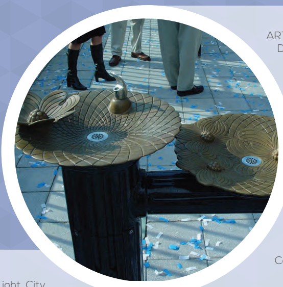
ARTIST NANCY BLUM Dogwood Basins Charlotte Area Transit System - Charlotte, NC

Cast in bronze, thirty basins are positioned along 15 stops of the Charlotte Area Transit System. Sitting on a base by Haws Co. the dogwood basins integrate the platforms functional needs with a specific and unique design. Commissioned by Charlotte Area Transit System (CATS) Charlotte, NC Engineering and Pattern: Leonard Owen, Dallas TX Castings: Polich Tallix, Rock Tavern, NY