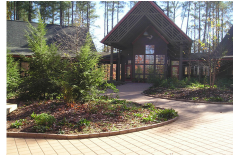
Hemlock Bluffs Nature Preserve 2616 Kildaire Farm Rd.