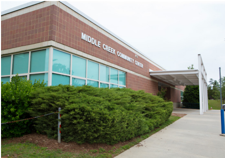
Middle Creek Community Center 125 Middle Creek Park Ave.