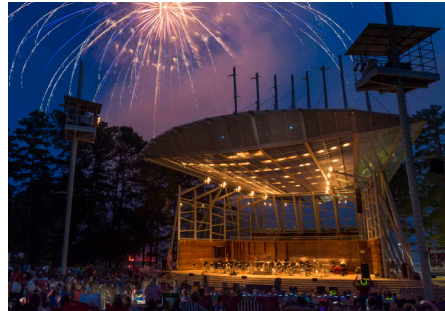
Koka Booth Amphitheatre 8003 Regency Pkwy.