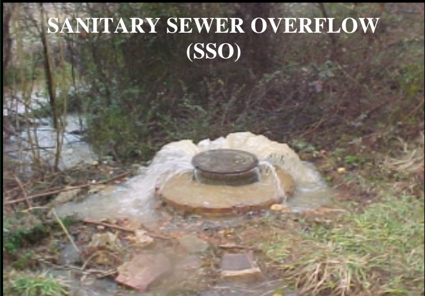
SANITARY SEWER OVERFLOW (SSO)