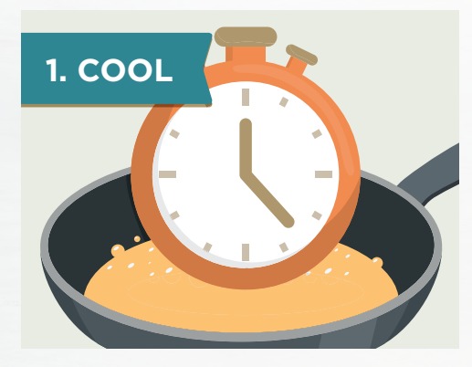
COOL F.O.G. to a safe temperature after cooking